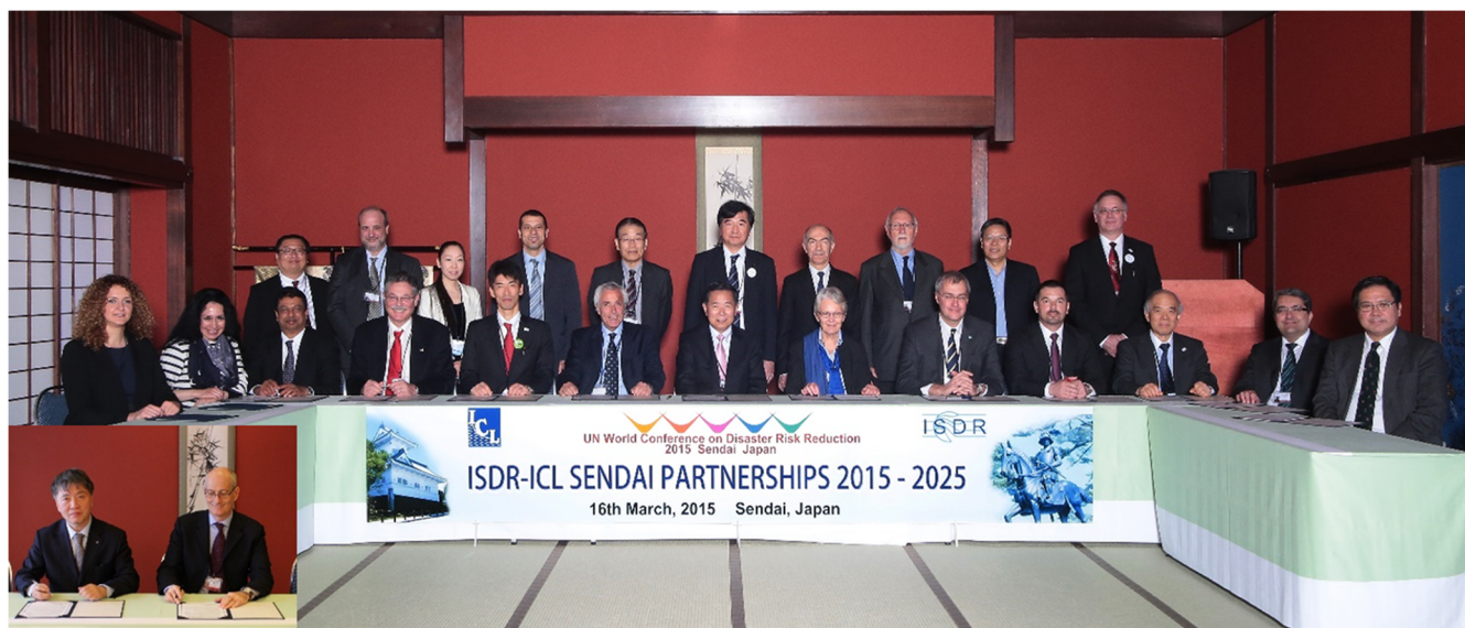
Fig. 2 Signing ceremony of ISDR-ICL Sendai Partnerships 2015–2025 on 16 March 2015 in Sendai, Japan